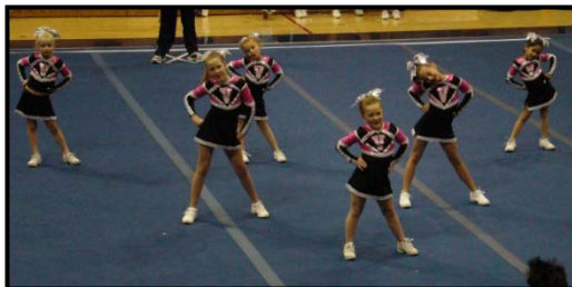
MINI TEAM AGES 5-8

Tumbling classes are open for new sign ups year round.