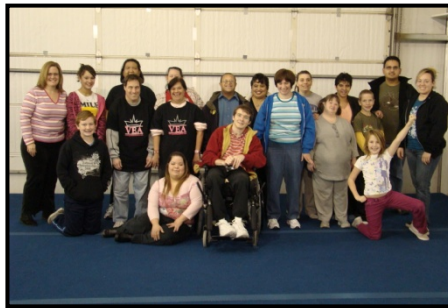
SPECIAL NEEDS TEAM