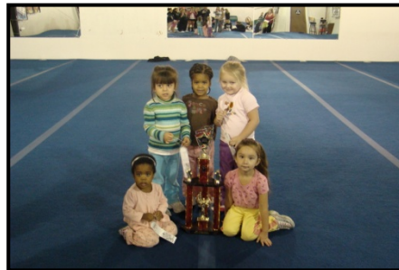
TINY TEAM AGES 2-5

We strongly believe that family, religion and school are top priority for every athlete.