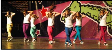
SENIOR HIP HOP TEAM