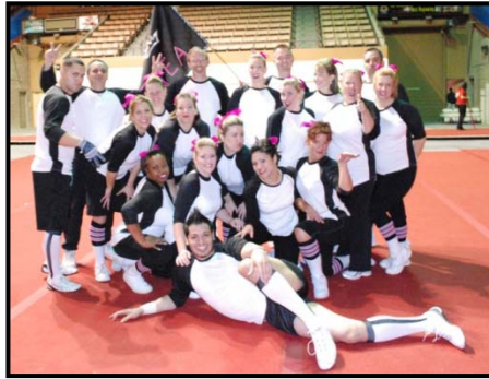
PARENT TEAM AGES 18 AND UP