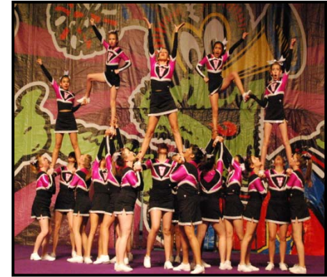
SENIOR TEAM AGES 11-18

"It's not the glitz of the uniform that matters, but the spirit that shines within!"